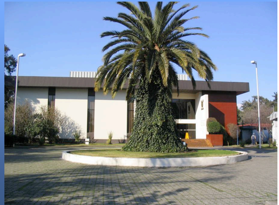
External sight of congress installations

The installations and the personal Are ready to face the organization Congress challenge. The university Have 700 professors 20.000 students, and 1.300 administrative officials.