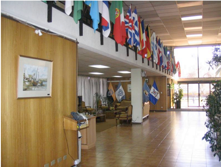
Congress receiving hall

The installations and the personal Are ready to face the organization Congress challenge. The university Have 700 professors 20.000 students, and 1.300 administrative officials.